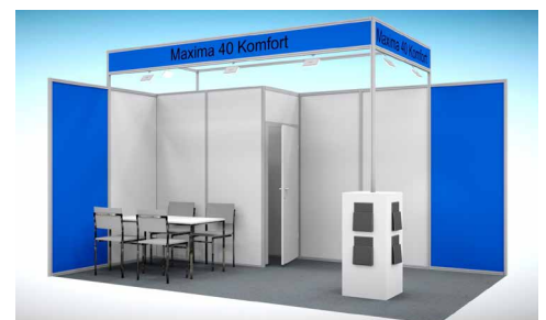
Pictures: Design of corner stand 15 sqm (additional equipment on demand)